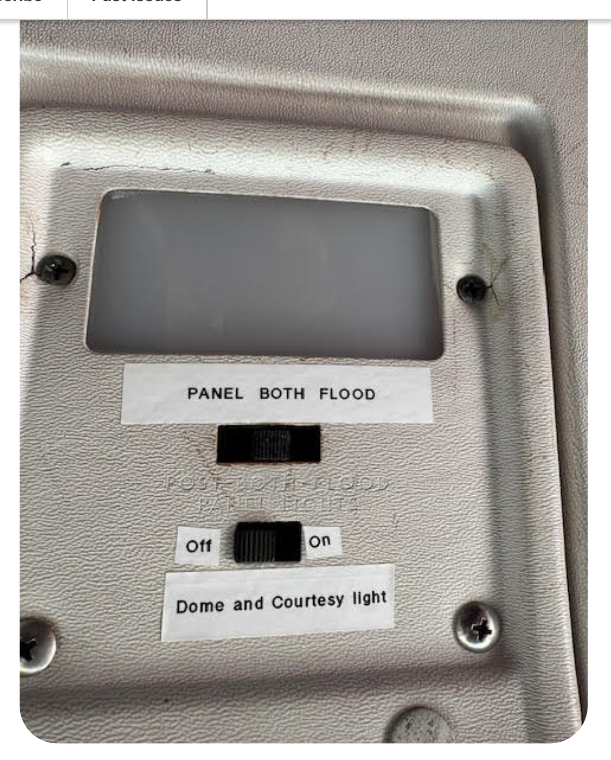
by Avram S.

Did you know – there is a light switch in the ceiling of the 172 cabin that turns all the panel lights on and off?